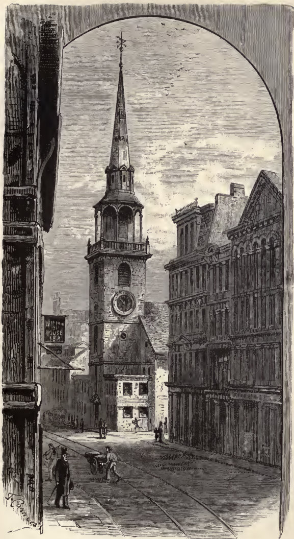
OLD SOUTH CHURCH, BOSTON.